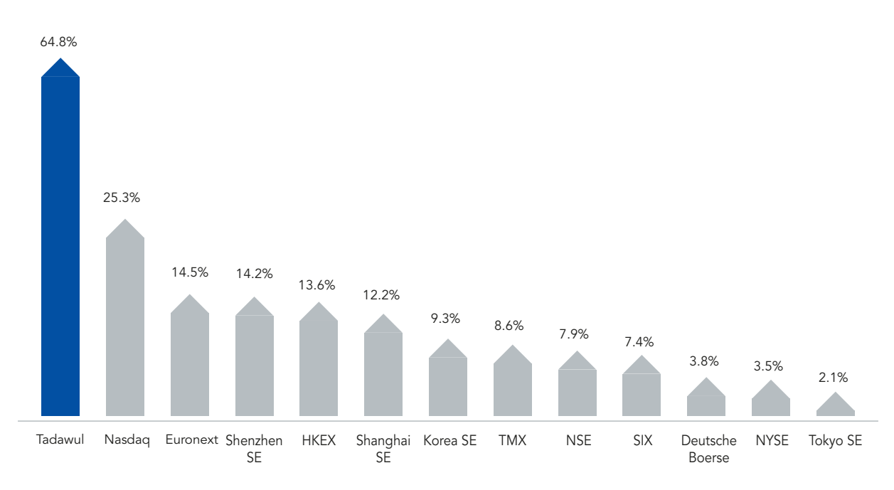
Figure (3-1): Fastest domestic market capitalization growth

Fastest growth amongst Top exchanges by market capitalization globally